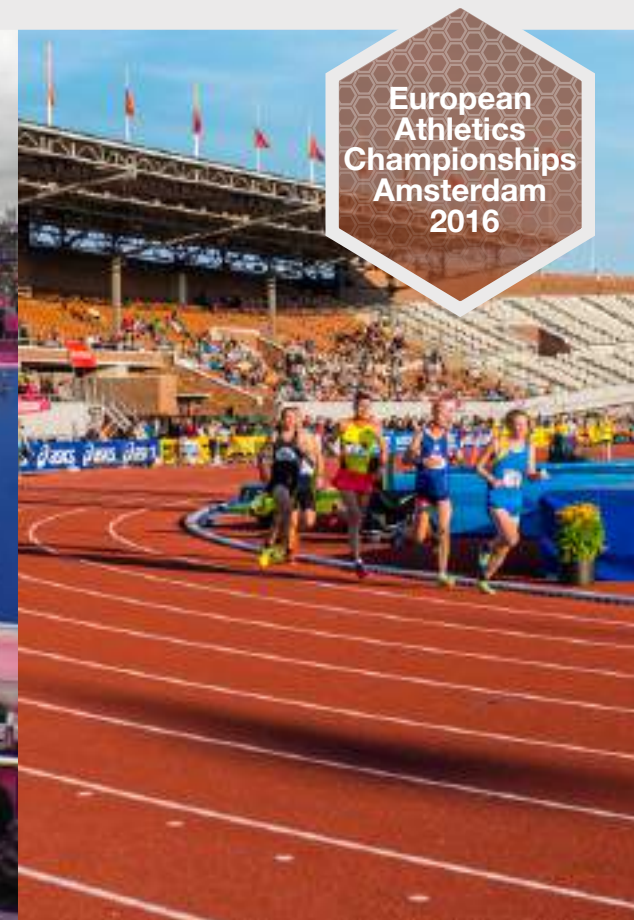
European Athletics Championships Amsterdam 2016