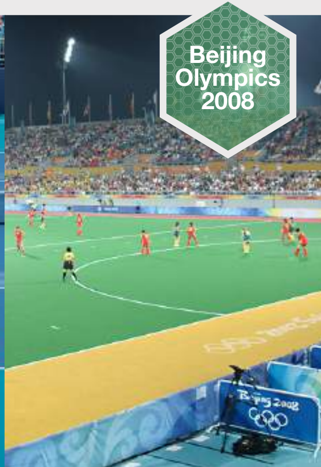
Beijing Olympics 2008