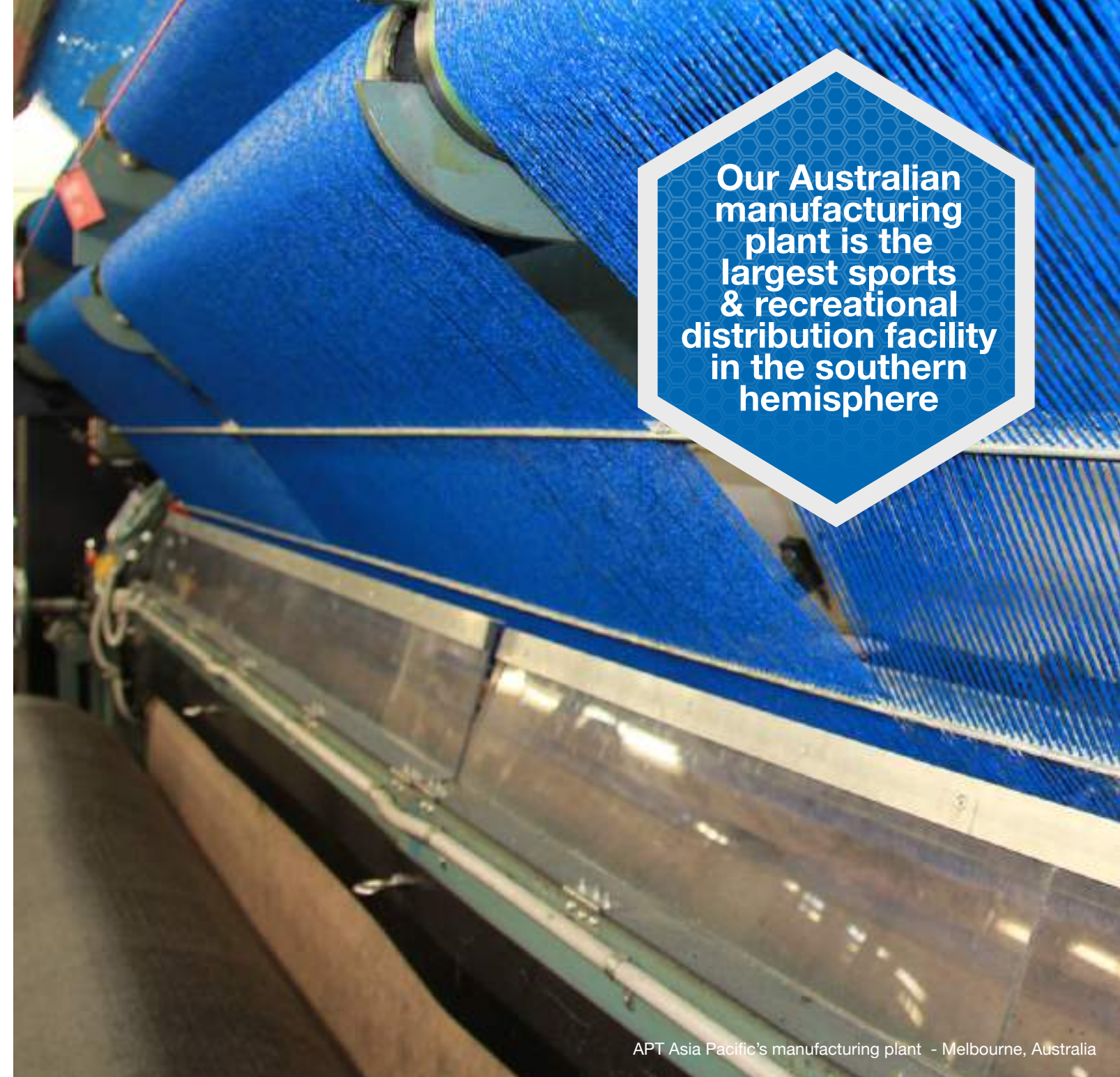
APT Asia Pacific's manufacturing plant - Melbourne, Australia

Our Australian manufacturing plant is the largest sports & recreational distribution facility in the southern hemisphere