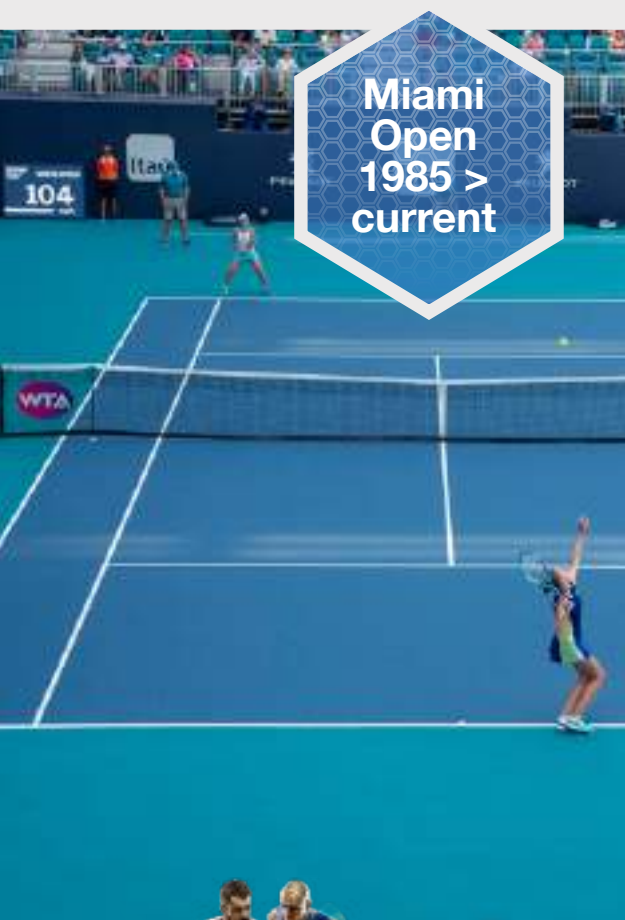
Miami Open 1985 > current