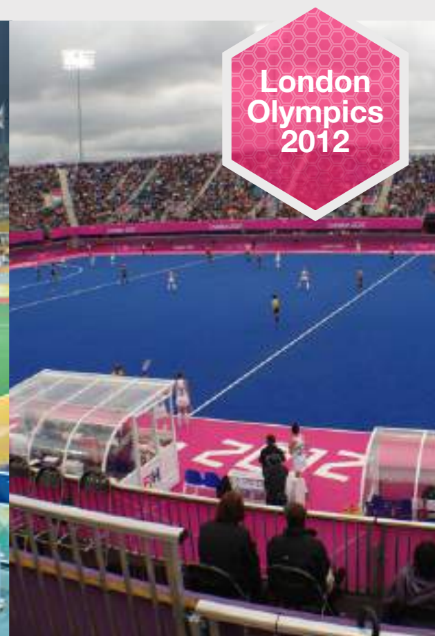
London Olympics 2012