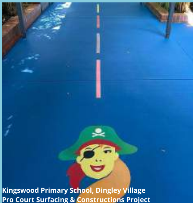
Kingswood Primary School, Dingley Village Pro Court Surfacing & Constructions Project