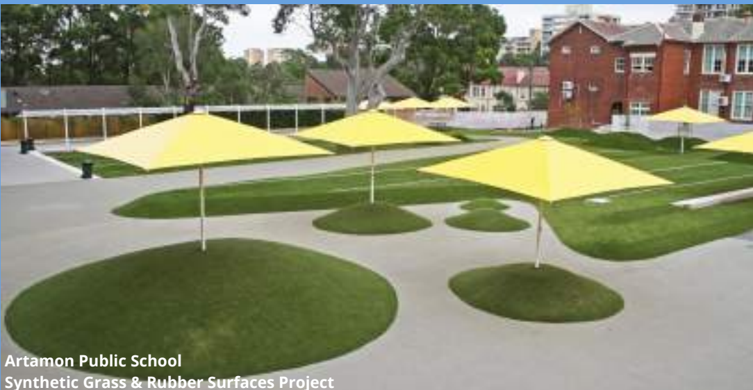
Artamon Public School Synthetic Grass & Rubber Surfaces Project