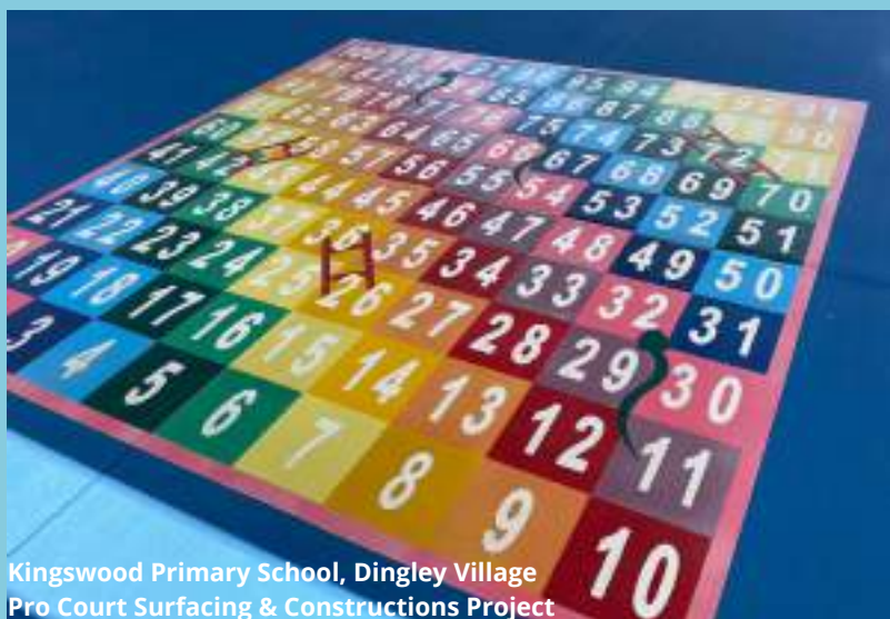
Kingswood Primary School, Dingley Village Pro Court Surfacing & Constructions Project