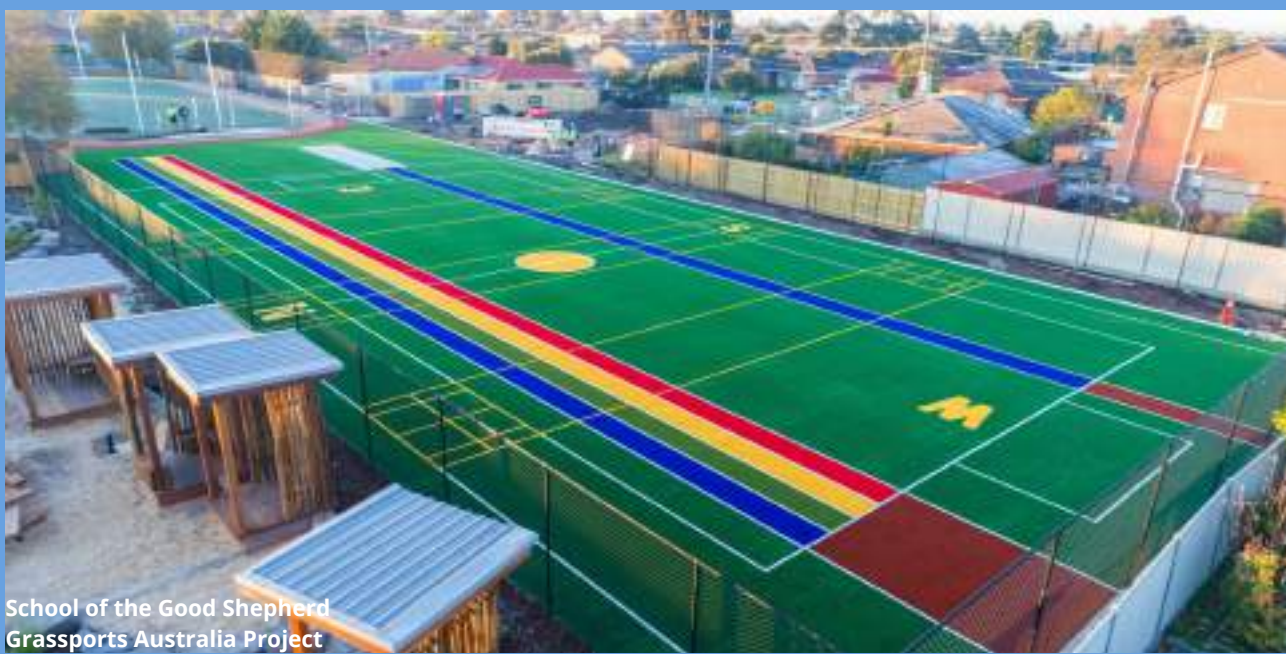
School of the Good Shepherd Grassports Australia Project