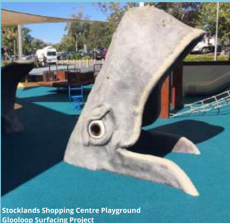
Stocklands Shopping Centre Playground Glooloo Surfacing Project